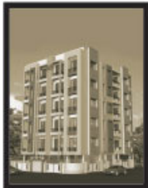
A Project Developed By "Home Maker" (since 1982)

It Consists of 10 Flats 3BHK Apartment. All These Apparts are Road Facing. It Has Sufficient Parking Area. Is Has One Lift With Generator It Will Be a Luxury At An Affordable Price Like All Our Value Added Earlier Schemes.