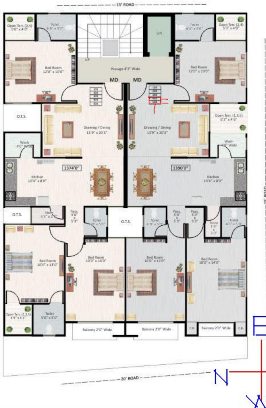
TYPICAL FLOOR PLAN ( 1st to 5th )